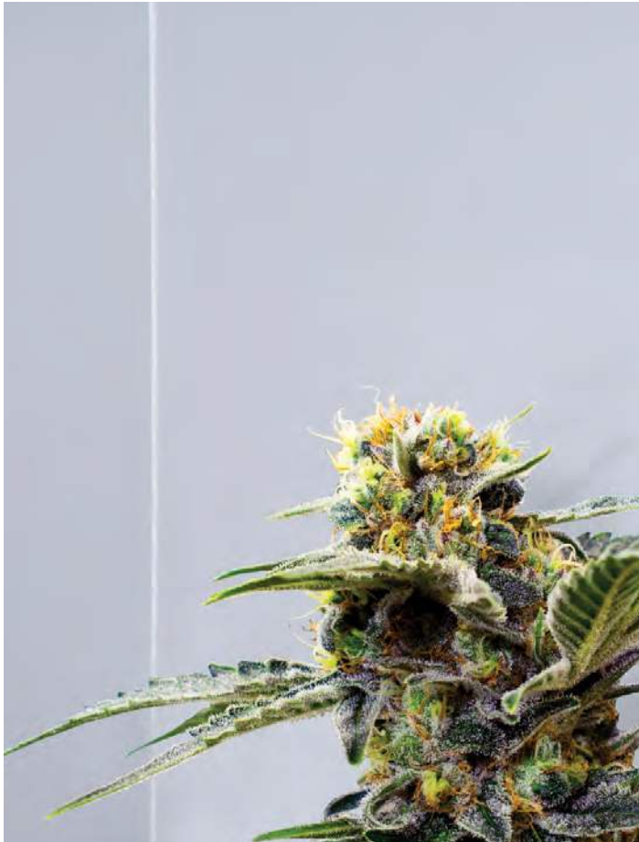
GLASBORD SMOOTH | WHITE (85) AND POLYURETHANE SEAM SEALANT

Protect your facility in a clean environment with Crane Composites resilient wall coverings. Our Glasbord with Surfaseal offers unsurpassed hygiene and durability for agricultural applications, including cannabis grow facilities.