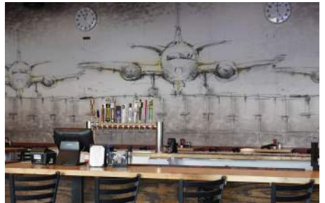
THE CUSTOM PROGRAM