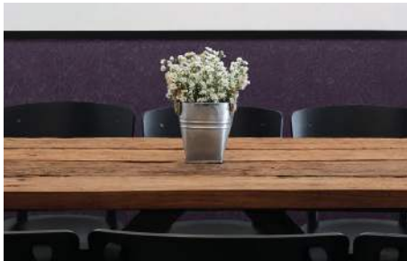
THE RUNWAY COLLECTION