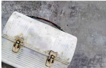
THE CITY WORKS COLLECTION