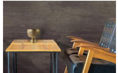
THE PATHWAYS COLLECTION