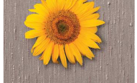
THE HEARTLAND COLLECTION