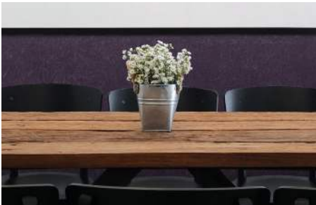
THE RUNWAY COLLECTION