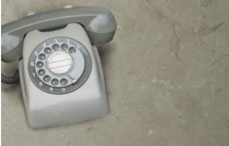
THE CLASSICS COLLECTION

Look at our patterns available in our collections