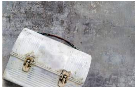
THE CITY WORKS COLLECTION