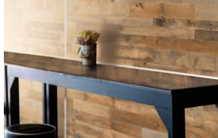
THE FOREST COLLECTION