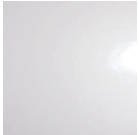
POLAR WHITE (8410)