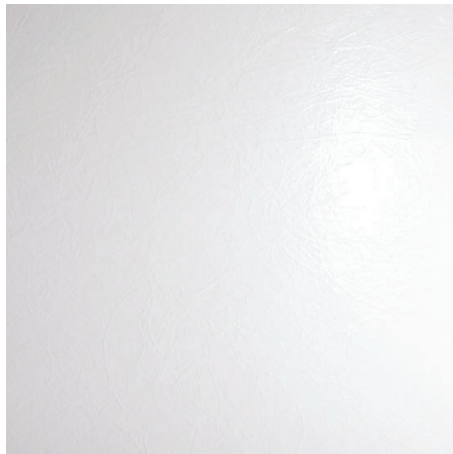
POLAR WHITE (8016)