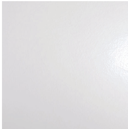
POLAR WHITE (8211)