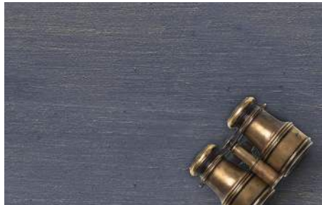
THE PATHWAYS COLLECTION