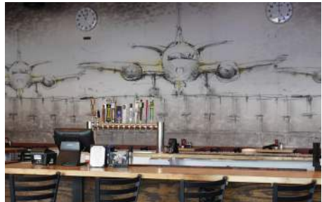
THE CUSTOM PROGRAM