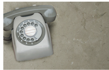
THE CLASSICS COLLECTION