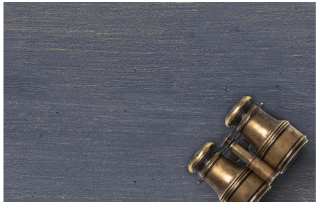
THE PATHWAYS COLLECTION