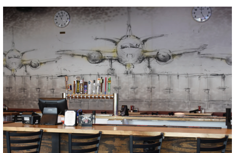
THE CUSTOM PROGRAM