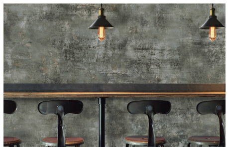
THE CITY WORKS COLLECTION