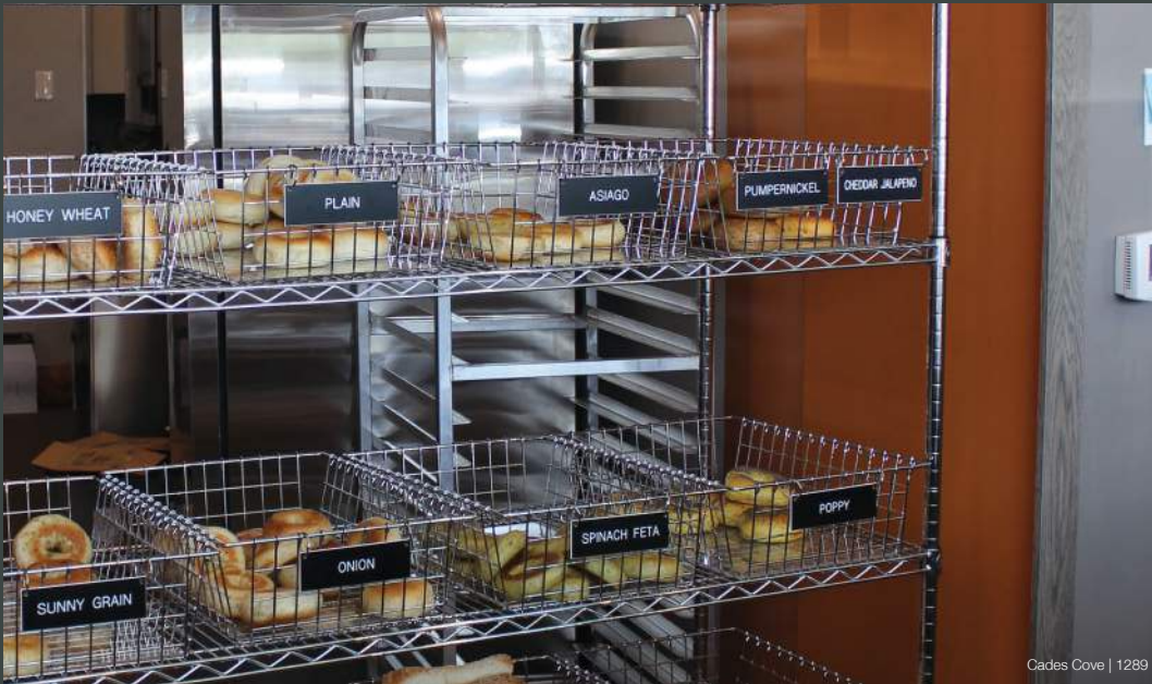
Cades Cove | 1289