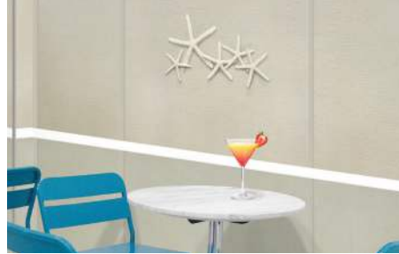
THE SANDS COLLECTION