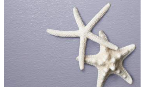
THE KEYS COLLECTION