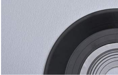
THE CLASSICS COLLECTION

Look at our other collections for more color options.