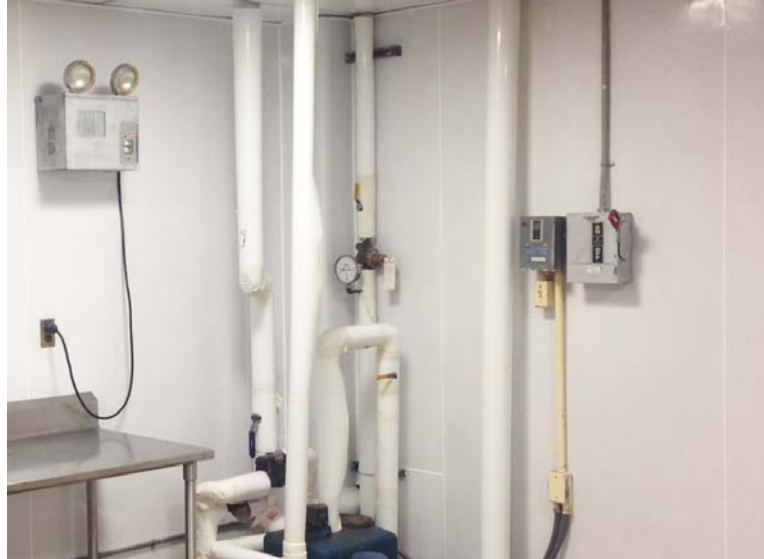
Guardian Drug Company in Dayton, NJ | Installed in January, 2015

Headquartered in Dayton, New Jersey, Guardian Drug Company is one of the nation's largest manufacturers of over-the-counter (OTC) pharmaceuticals. Guardian Drug Company's customers include the nation's leading drug store chains, mass merchandisers, supermarket chains, wholesalers and distributors.