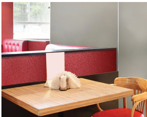
MAUNA RED SANDSTONE (1296) + MORNING MIST GRAY SANDSTONE (636)