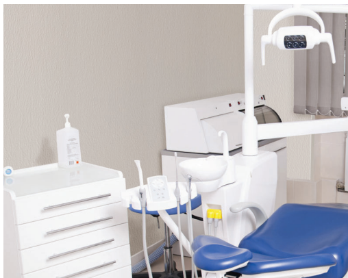
ALMOND BREEZE SANDSTONE (866)