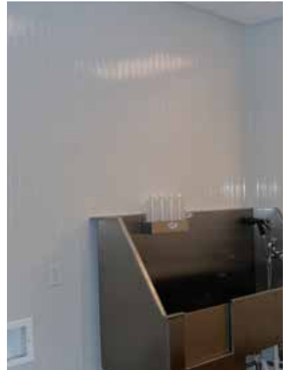
VARIETEX BEADED | COTTON WHITE (1130)

Take your surfaces beyond traditional frp with a tile look, linen or sandstone textures. The grout lines are sealed for easy maintenance, avoiding the grimy build up encountered with regular tile.