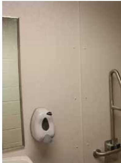
SEQUENTIA EMBOSSED | SILVER (0066)