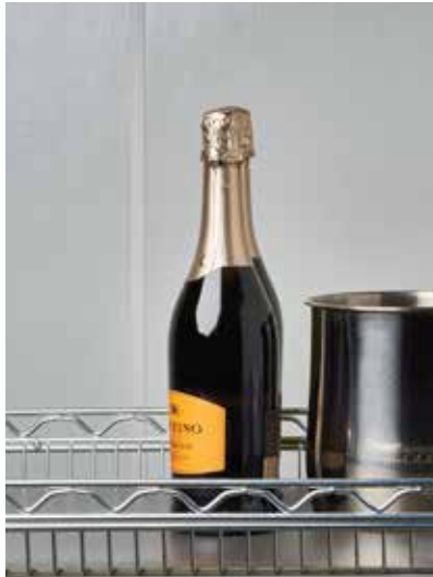
VARIETEX LINEN | MORNING MIST GRAY (636)