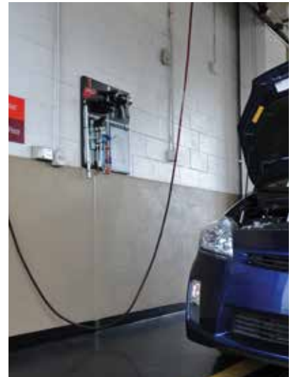
SEQUENTIA EMBOSSED | BEIGE (0070)

Add structural strength with SEQUENTIA LAMINATED PANELS featuring an FRP panel laminated to a rigid substrate, which can be installed directly to studs or used as a ceiling panel.