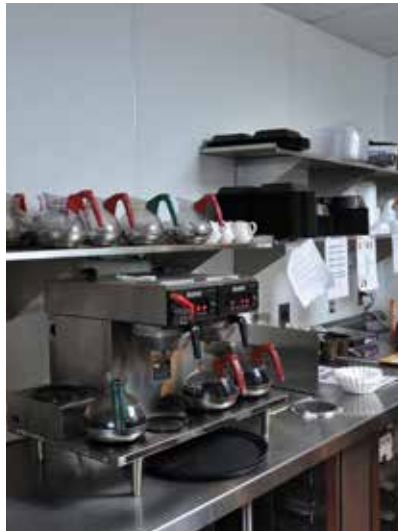
SEQUENTIA EMBOSSED | WHITE (1130)