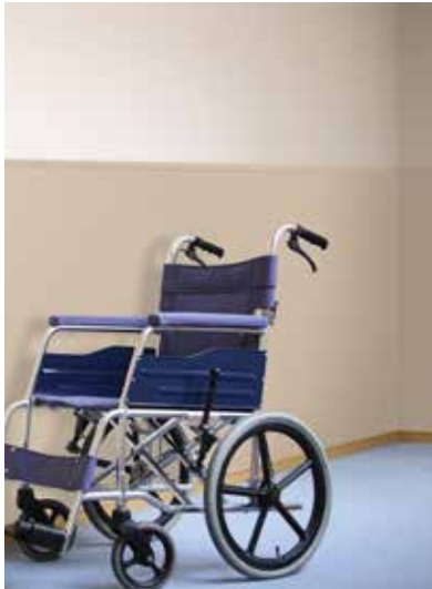
VARIETEX SANDSTONE | ALMOND BREEZE (866)