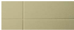
Almond Breeze | 866