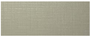
Pepper Dust | 8044 (Satin)