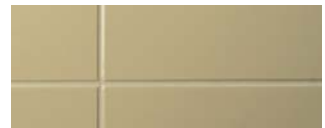
Parchment | 866 (Gelcoat)

Patterns and colors are a representation and may not accurately reflect the final product. Please obtain a sample of the product before making a final selection at FRPSamples.com