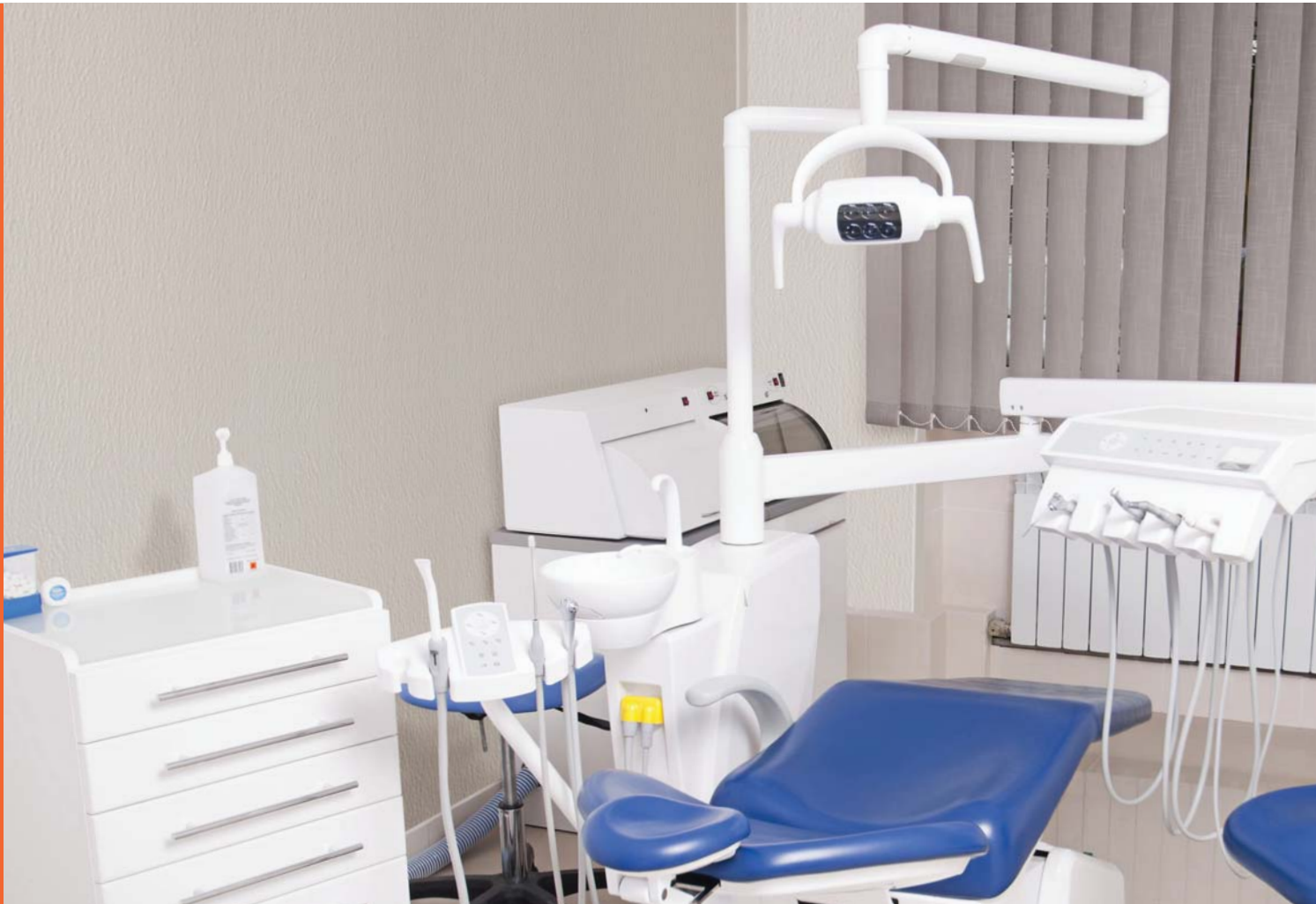
SANDSTONE | CLASSIC COLLECTION | ALMOND BREEZE (866)

Take your surfaces beyond the traditional frp white bumpy board. Our Varietex resilient wall coverings offer you a wide range of stylish finishes and colors, while still meeting the sanitary requirements of even the toughest commercial environments.