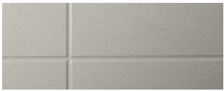
Cotton White | 1130