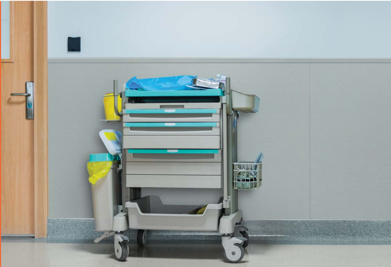
VARIETEX SANDSTONE | MORNING MIST GRAY (636)

Take your surfaces beyond the traditional frp white bumpy board. Our Varietex resilient wall coverings offer you a wide range of stylish finishes and colors, while still meeting the sanitary requirements of even the toughest commercial environments.