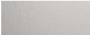
Cotton White | 1130