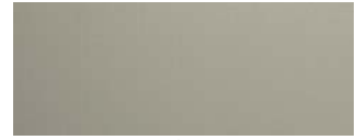
Morning Mist Gray | 636