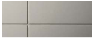
White Wash | 488 (Gelcoat)