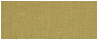
Corn Silk Canvas | 008C