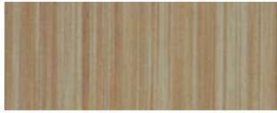
Sierra Ash | 010SA