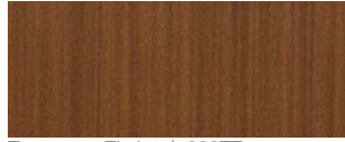
Tennessee Timber | 003TT