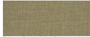
Chrome Canvas | 011C