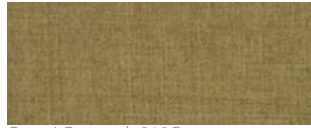
Camel Canvas | 010C