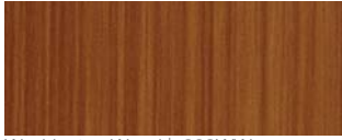
Washington Wood | 008WW