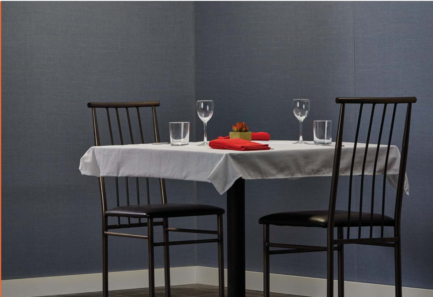
DESIGNS | COASTAL CANVAS

Take your surfaces beyond the traditional frp white bumpy board. With our DESIGNS resilient wall coverings, bring both style and durability into any commercial space. No need to sacrifice aesthetics for hygiene – Crane DESIGNS offers you endless options to create the look you are envisioning for your walls.