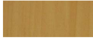
Maryland Maple | 009MM