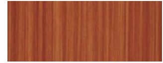
Carolina Cherry | 002CC