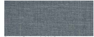
Coastal Canvas | 007C