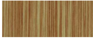
Baton Rouge Bamboo | 001BRB