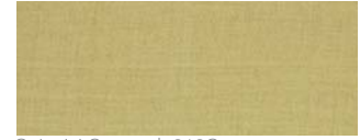
Colonial Canvas | 012C