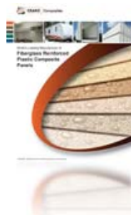
Crane Composites Capability Brochure

We offer a range of services that support the Building Products, Recreational Vehicle, and Transportation industries.